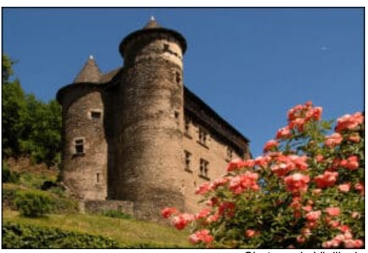
Chateau de Vieillevie

This charming village in the valley where renowned pig and horse fairs were once held, lies at the foot of its remarkable 15th and 16th century castle with wooden hoardings. The small Romanesque church is decorated with historiated capitals and double-arched windows. Near Vieillevie, on the left bank of the Lot, Montarnal is built at the foot of its ancient fortress (XIII century) of which a decapitated round tower remains.